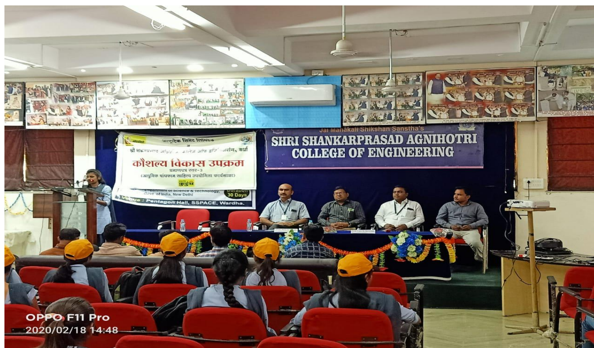
Event 32. Photo of Kaushal Vikas Upkram By Ultratech on Dated 18/02/2020